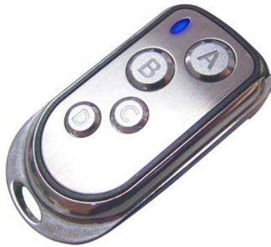
W-2 Wireless Transmitter

Wireless remote control system W-2 consists of a transmitter equipped with four buttons to activate, deactivate, increase and decrease fog output and an onboard receiver attached to the rear panel of FT-100 fog machine.